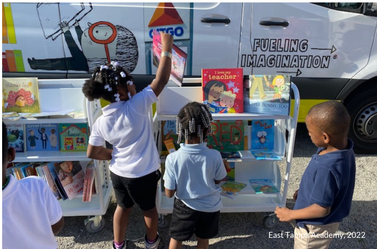
East Tampa Academy, 2022