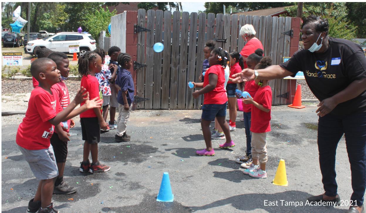
East Tampa Academy, 2021