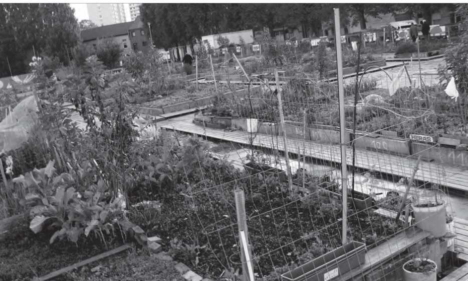
Community garden in Gent, Belgium.