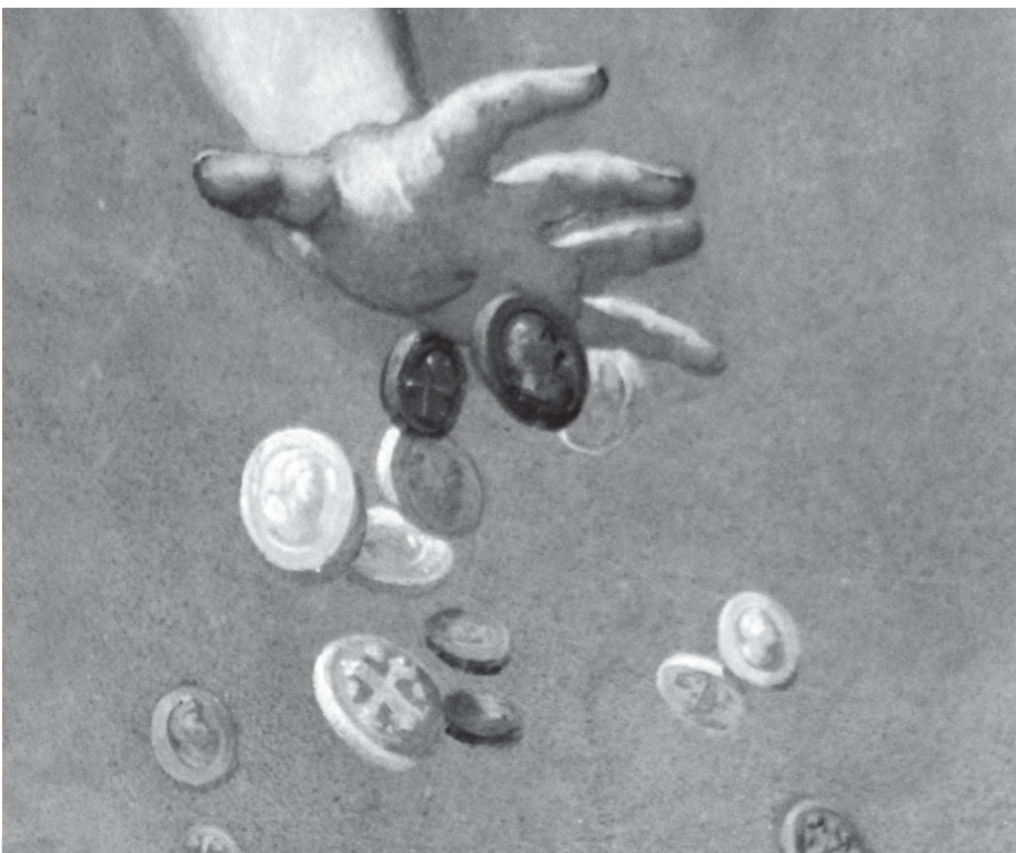
Photo: Hand with coins. Detail from fresco at St. Charles Church, Vienna.