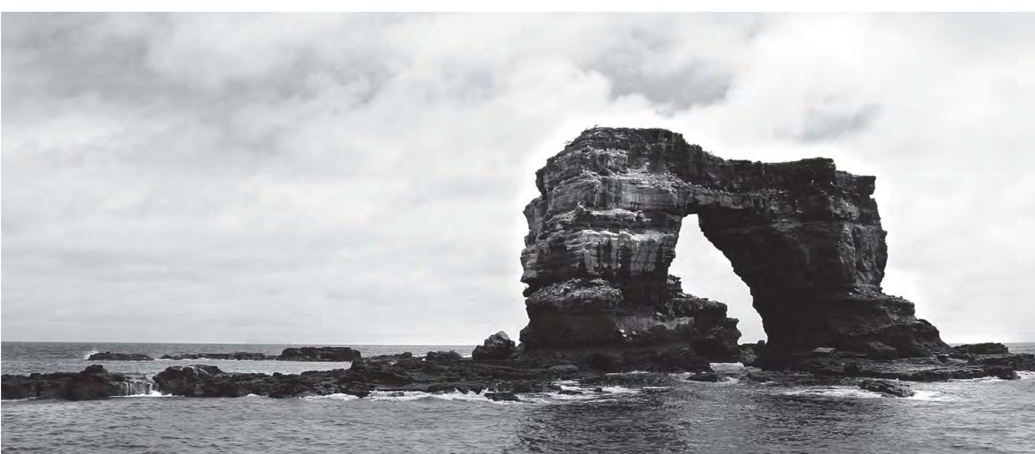
Darwin's Arch, Galapagos Islands.